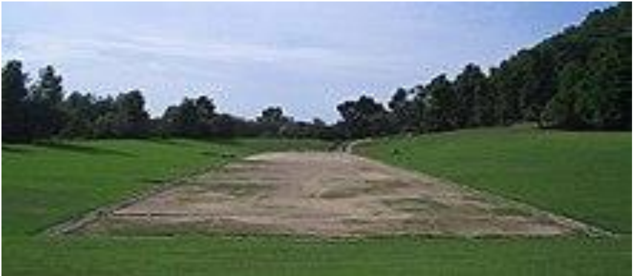
Stadium in Olympia, Greece